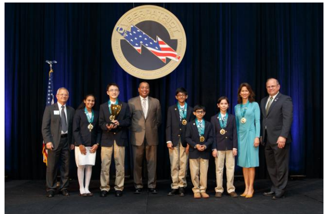
Middle School Students from the Nysmith School for the Gifted were the National Champions in Cyber Patriot VII

Gabriel Chapter supported several teams from Chantilly Academy in Fairfax, Virginia. The staff, AFA, and Northrop Grumman ran two practice sessions and provided study aids and mentors for the teams. Parents, community partners, and volunteers, including four members of the AFA Gabriel Chapter, supported the first round of competitions and provided mentoring throughout the competition. Subway has supported the competition since 2010 by offering AFA special rates for the